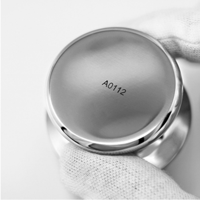
Example of optional laser marking