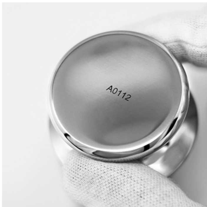
Example of optional laser marking