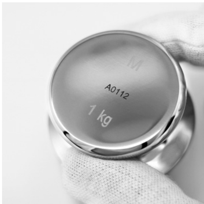
Example of optional laser marking