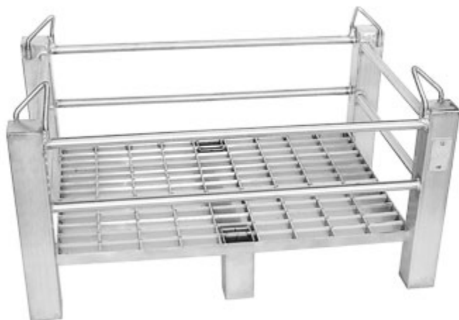
"WBX20500" weight holder