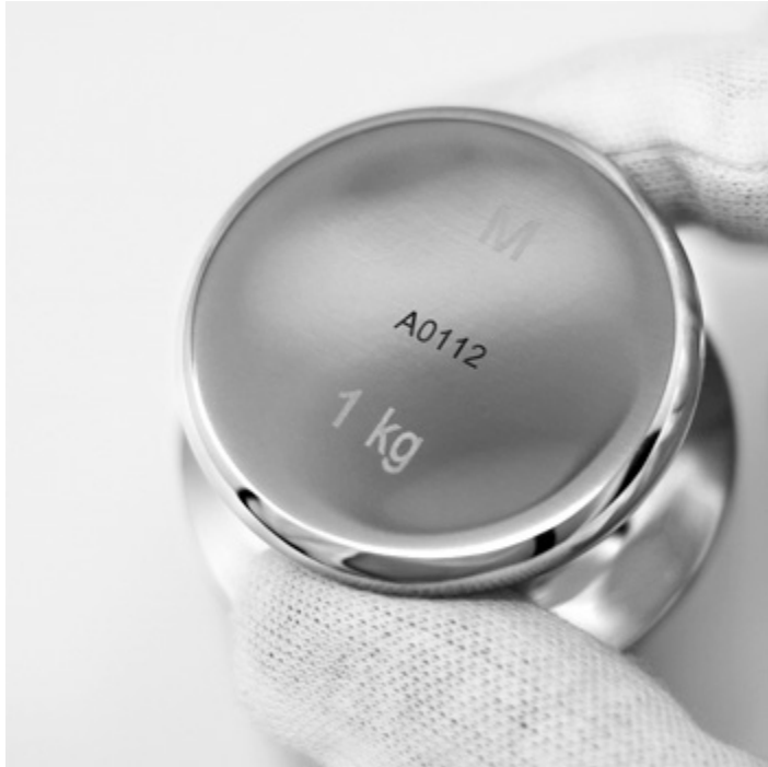
Example of optional laser marking